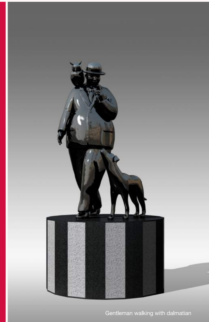
Gentleman walking with dalmatian

Ramada Encore Haeundae Stay where you've dreamed of. Those dreams are becoming your reality.